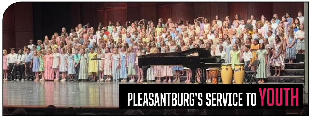
Elementary School Honor Choir

The honor choirs are composed of students from every elementary and middle school in the Greenville County School system.