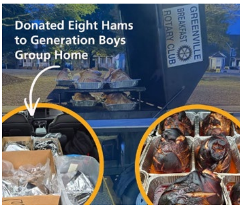
Donated Eight Hams to Generation Boys Group Home