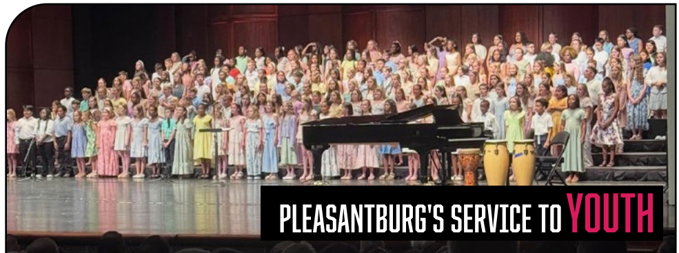
Elementary School Honor Choir

The honor choirs are composed of students from every elementary and middle school in the Greenville County School system.