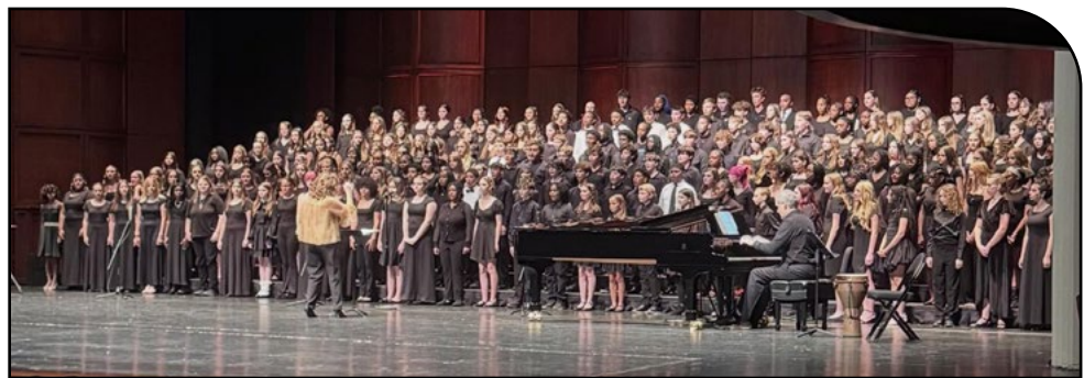
Middle School Honor Choir