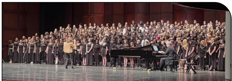
Middle School Honor Choir