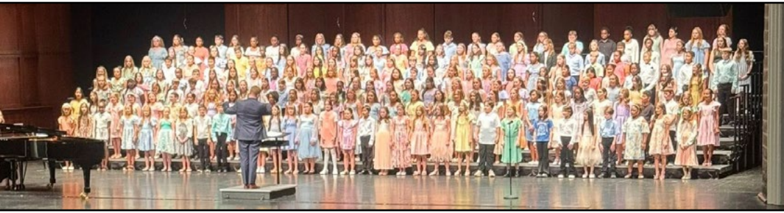
Elementary Honor Chorus, above, and Middle School Honor Chorus backstage awaiting curtains up.