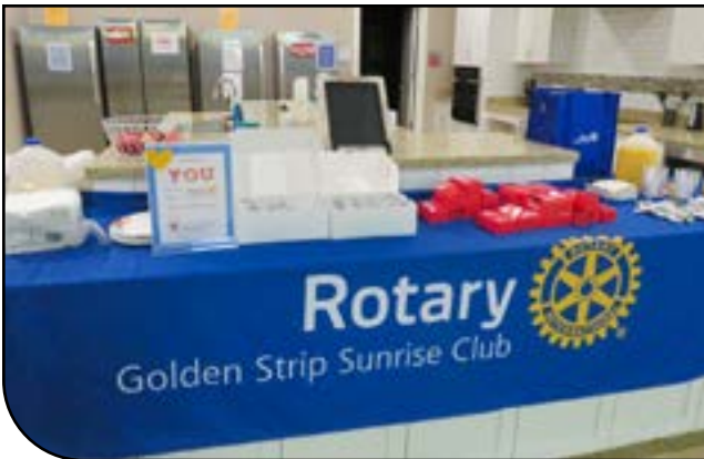
↑ Good public image.

Golden Strip Sunrise members provided breakfast for the residents and staff of the Ronald McDonald House in Greenville, then toured the facility on July 25.