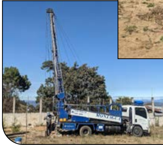
◀The first Paquixic well, January 2024.

During my most recent visit, I learned that a second well would be drilled. Both wells are funded by another NGO and no Rotary funds have been spent on the wells.