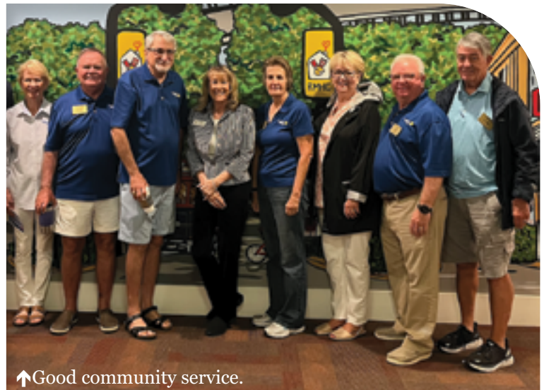
↑ Good community service.