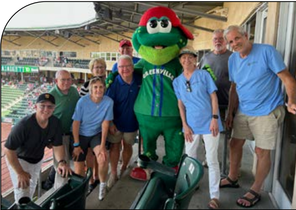
↑ Good club camaraderie.