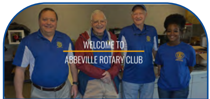
This is the cover photo of Abbeville's new website.

We've also established a blog that will continue to build our SEO (Search Engine Optimization) so that we can start ranking on Google sooner.