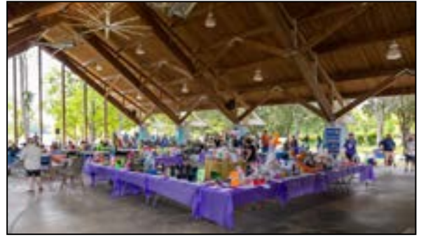
Duke Pavilion Silent Auction — some of the many items up for bid at the Silent Auction at Paddle for the Cure.

Five students from Crowders Creek Elementary sing the National Anthem at the Opening Ceremonies of Paddle for the Cure.