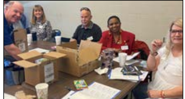
Lake Wylie Rotarians labeling children's books for distribution by Early Learning Partnership of York County.

Clover High School Interact Club members with books labeled for the five Little Free Libraries in Lake Wylie supported by the Lake Wylie Rotary Club.