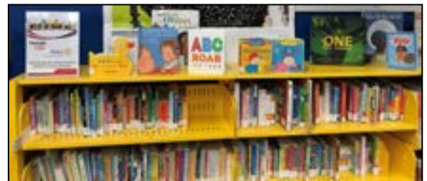
A sampling of the books donated by the Lake Wylie Rotary Club to the Lake Wylie Branch of the York County Library.