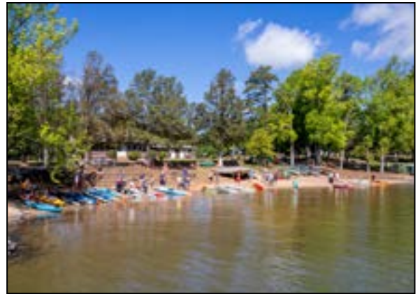
Getting ready for Paddle for the Cure.