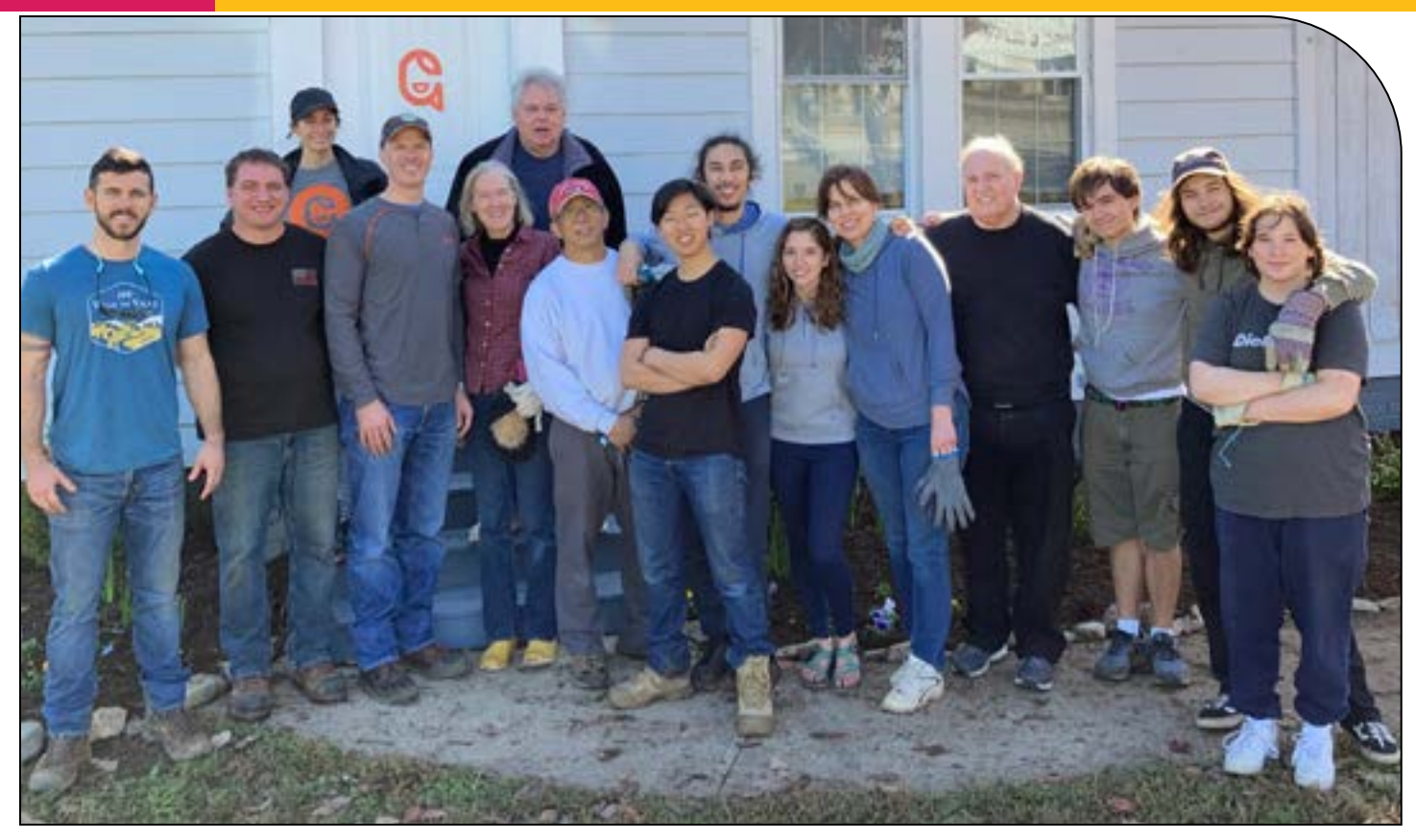
Rotarians and Friends who helped with the Greenville Breakfast landscaping project.