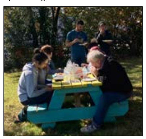
Enjoying BBQ afterwards.