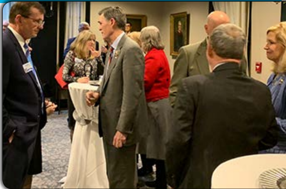
Donors celebrating our Rotary Foundation at the Million Dollar reception Nov. 29.