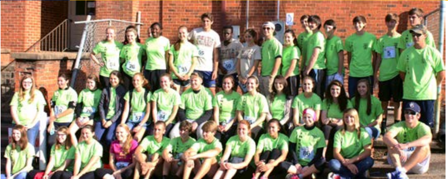
Seneca Interact members worked with the West-Oak Interact Club and our District Youth Exchange Students to run and help manage the Rotary Oktoberfest 5K to raise funds for polio eradication. Interact members volunteered as timers, course monitors, manned water stations and helped with registration activities.