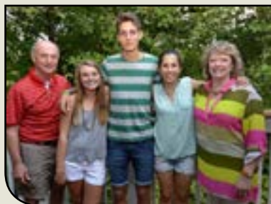
Three students, three cultures. See page 3.