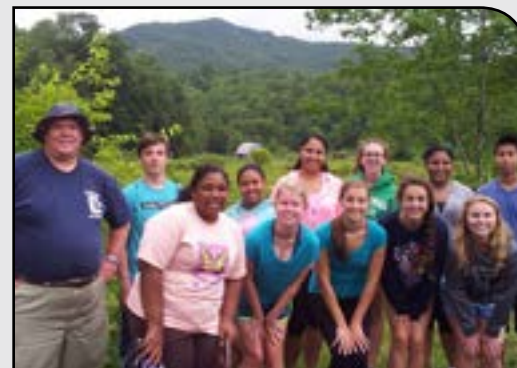
Clover Interact Club leaders and sponsors go on four-day mountain planning retreat. Page 3.

100% (54) CLUBS THAT HOLD ROTARY DAY | 0 ACHIEVED