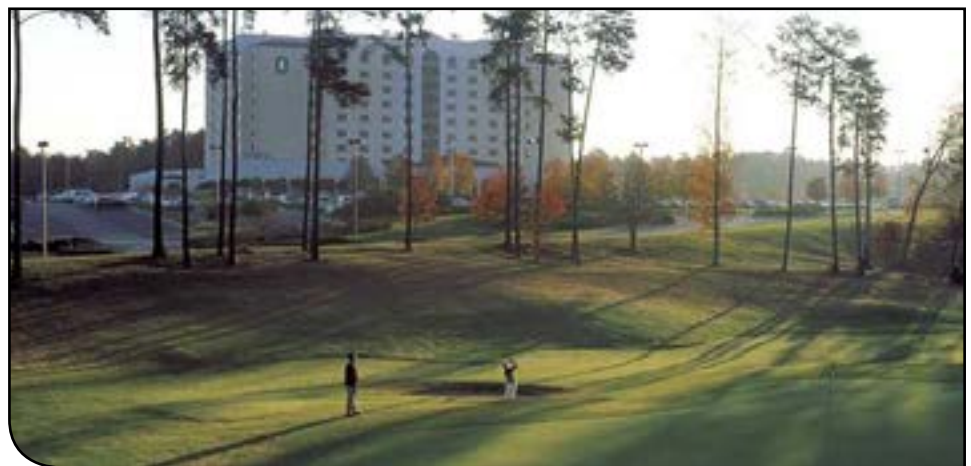
Embassy Suites, Greenville | May 1-3, 2015

The District Conference is scheduled for May 1-3, 2015. The conference will be held in Greenville at the Embassy Suites Resort. Count on great fellowship, great fun, great networking opportunities, great speakers and great food. Begin the weekend with a round of golf or a set of tennis on the resort property followed by a Luau and dancing. Wear your best Hawaiian shirt! Saturday and Sunday will be even more fun plus a fabulous lineup of speakers! We look forward to seeing you there!