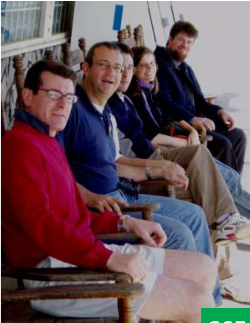
The inbound GSE team in the Spartanburg area.