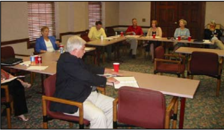
The selection committee at work.