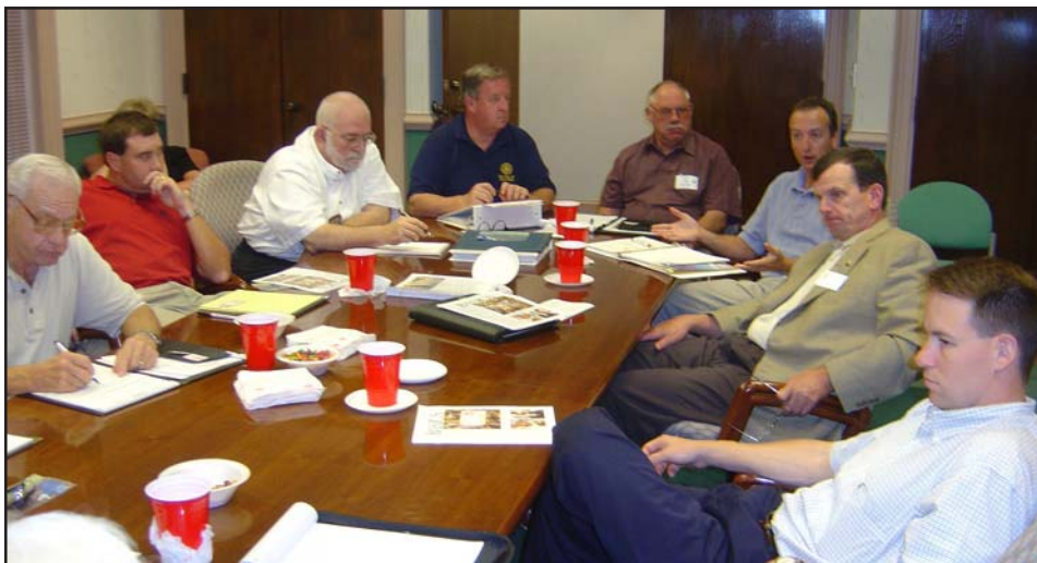
These were some of the participants in the membership seminar held Aug. 30 in Clemson.

Photos from the Aug. 30 Clemson meeting inside.